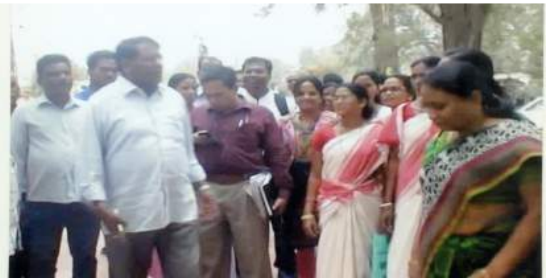
Field visit to the Resettlement Colony

F45 After completion of the meeting with the authorities of Rourkela Steel Plant, the Commission made field visit to the Resettlement colonies at Jolda village. Commission visited all the three Blocks of A.B & C. During visit it is noticed that the road condition is very poor. The inhabitants have not been provided with safe drinking water. The present electricity is not sufficient to cater the need of the Households. It was brought to the notice of the Commission that no land was earmarked for the tribals for ‰arna+ (place of worship) although lands have been allotted forother religious place for which they have been discriminated. Hondple Chairman stated that the matter will be taken up with the District Administration as well as with the management of RSP. After completion of visit Hondple Chairperson instructed the Additional District Magistrate, Rourkela to give focus about the basic amenities like safe drinking water, electricity, road etc.