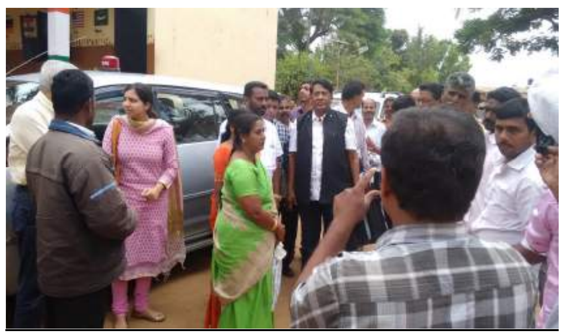
Dr.Rameshwar Oraon, Hon'ble Chairperson, NCST in PHC, Basvanahalli

Visit to Primary Health Centre, Mobile unit building, Basavanahalli