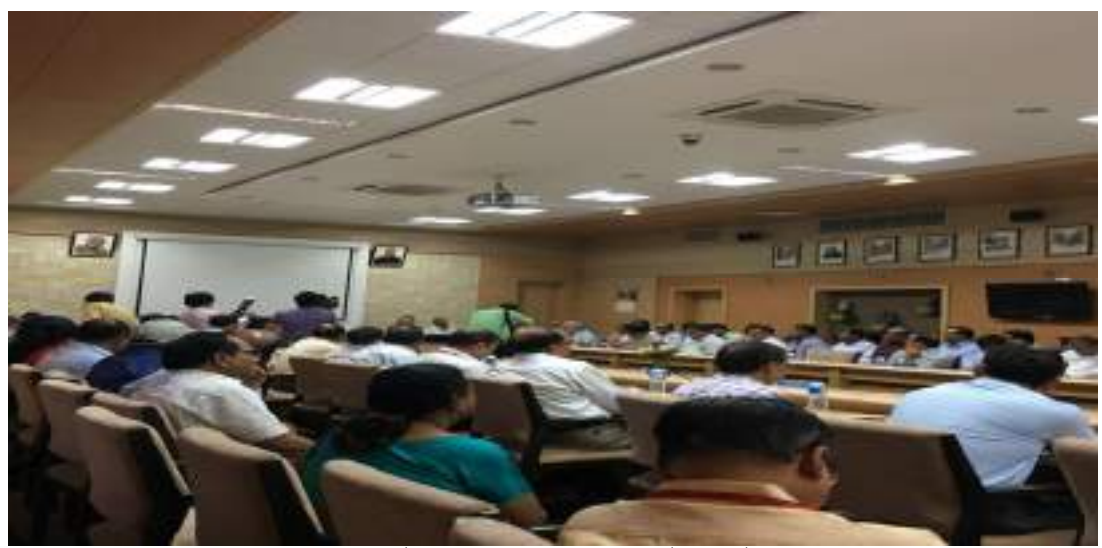
राष्ट्रीय अनुसूचित जनजाति आयोग द्वारा वल्लभ भवन, भोपाल में ली जा रही राज्य स्तरीय समीक्षा बैठक के दृश्य।

NCST_11R_2015-16_CH.2_ACTIVITIES OF THE NATIONAL COMMISSION FOR SCHEDULED TRIBES