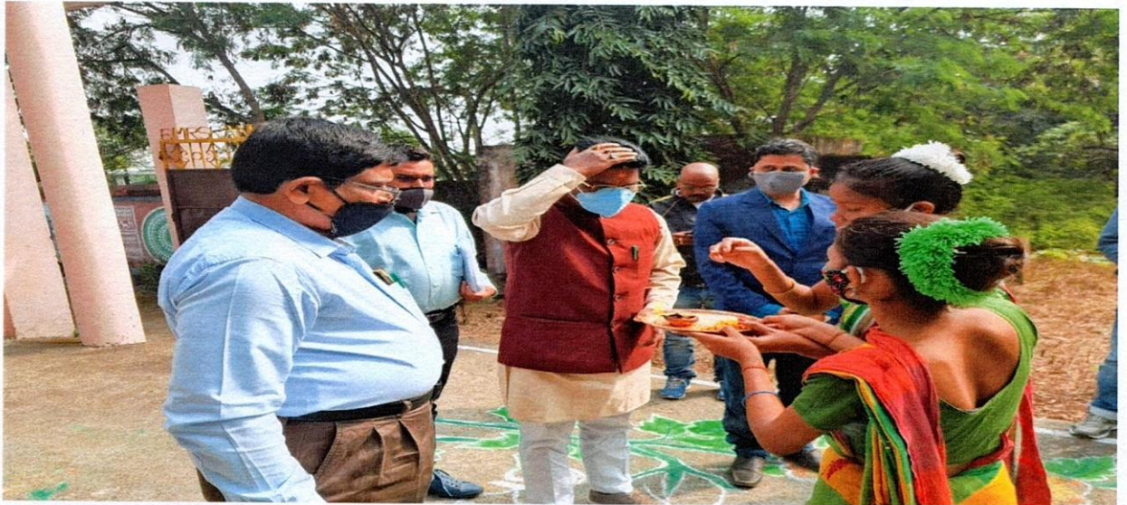
[Students of EMRS, Ranki receiving Shri Ananta Nayak, Hon'ble Member, NCST]

Thereafter, the Hon'ble Member was taken to various parts of the EMRS compound for inspection. During the said inspection each & every corner of the compound was inspected, including the playground, hostels, cooking area, dining areas, toilets, class rooms, laboratories, library, IT room, etc.