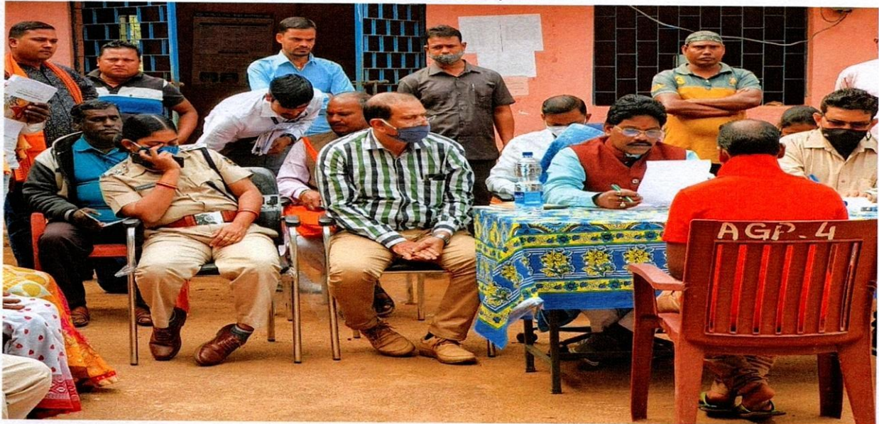
[Hon'ble hearing public grievance at Akul GP, Telkoi, Keonjhar]