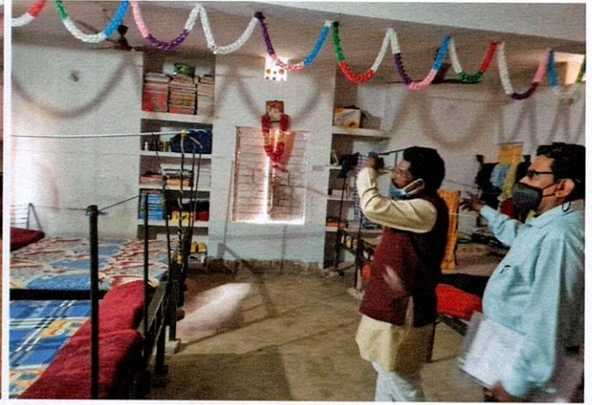
[Hostel, EMRS, Ranki]