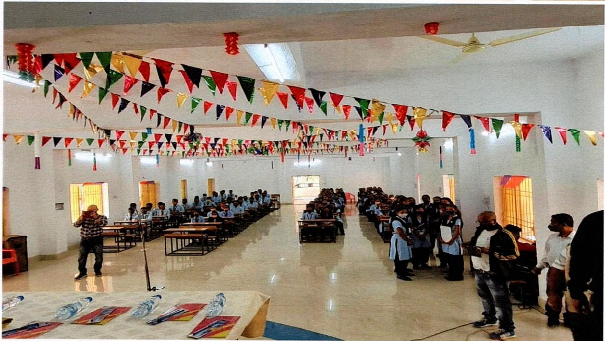
[During interaction with students & teachers of EMRS, Ranki in the Multipurpose Hall]