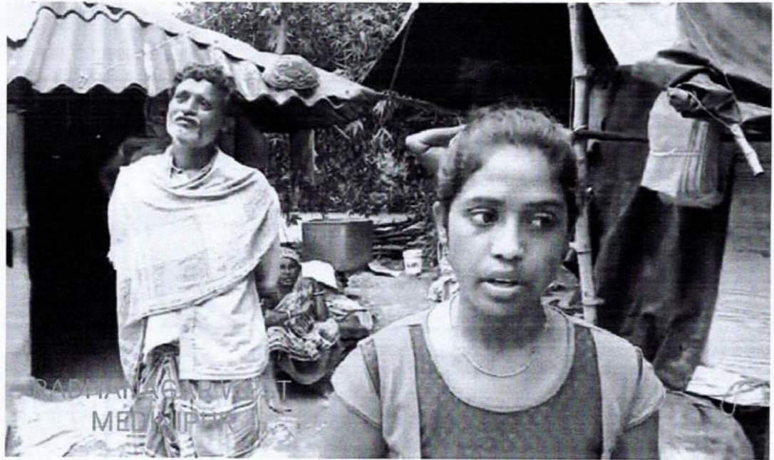
RADHANAGAR, PASCHIM MEDINIPUR