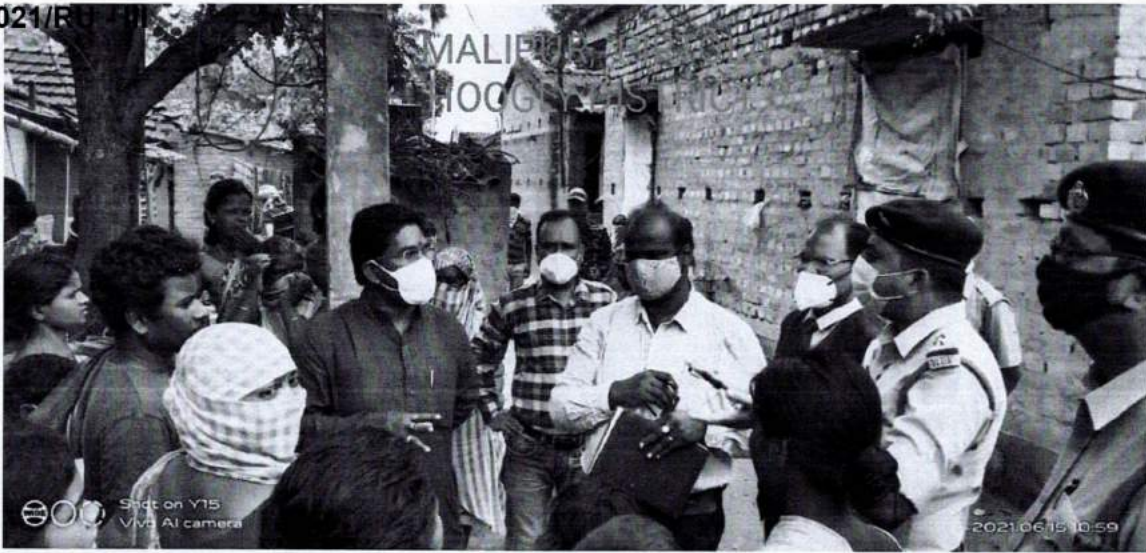
MALIPUR, PIRTOLA, HOOGLY DISTRICT