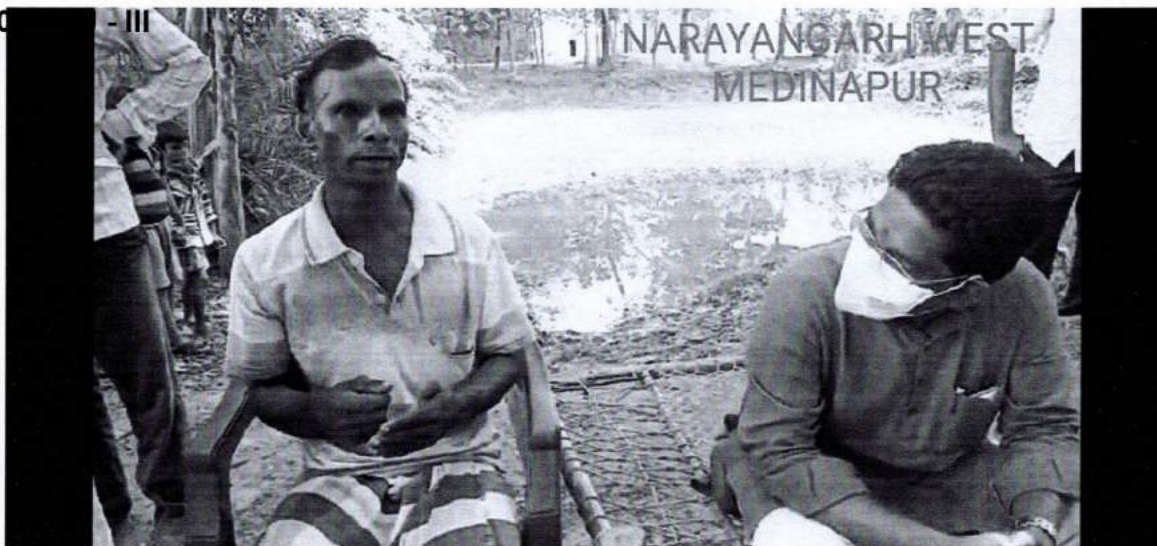
NARAYANGAR, PASCHIM MEDINIPUR