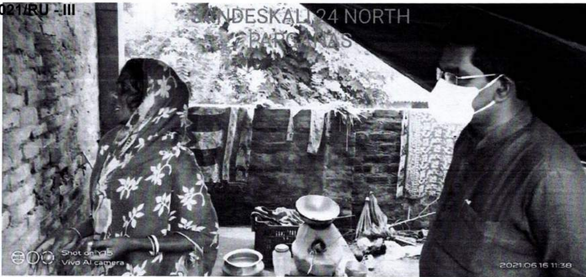
SANDESKALI 24 NORTH PARGANAS

At Chuchura local tribal people were threatened not to meet the visiting NCST team. It is learnt that 67 (sixty seven) houses of tribal people were attacked and looted, out of fear tribal people fled from their houses. At Sundarikhali of Surbaria GP, under Nazat Police Station tribal people were threatened to meet the NCST, as a result nobody was there to whom the Commission could have interacted. But it was learnt that, as many as 103 (one hundred three) houses of tribal people were ransacked and looted during the Post Poll Violence, but so far, no enquiry have been conducted by the local police, with the plea that there was no complaint. Similarly, at Kharihat, Bayarmari-2, as many as 15 (fifteen) houses of tribal people were burnt, forcing everyone to leave their house. Allegation came to the Commission that, the head of local Pradhan of GP demands money from the affected people, rather than helping them for their rehabilitation.