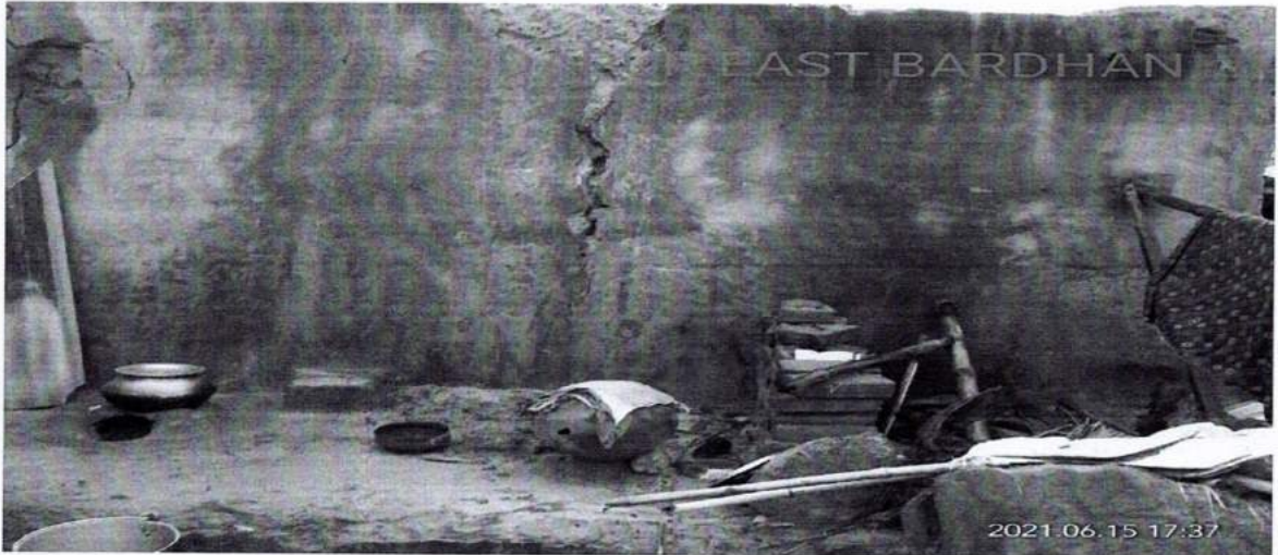
SODAPUR, EAST BARDHAMAN

The Commission also came to know about that the worship places of tribals are also destroyed which is scared to them and holds high sentimental value in their life. It was an unruly act by the anti-social elements. The entire scenario at this village is nothing but planned attacked to destroy the socio-cultural and economic conditions of the tribes living in Kakora village.