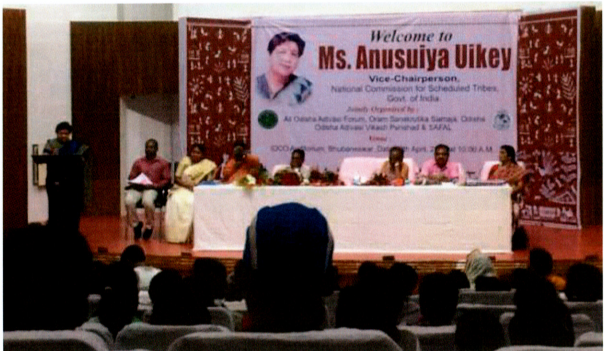
Figure 3: Miss Anusuiya Uikey, Hon'ble Vice Chairperson addressing the participants in the IDCOL Auditorium, Bhubaneswar

While addressing the gathering, Hon'ble Vice Chairperson of the Commission stated that the primitive tribes, who are residing in the forests have their constitutional rights like other citizens for which the Constitution of India given special rights/privilege to them. They should take advantage of these Constitutional provisions. The National Commission for Scheduled Tribes, a Constitutional Body have been set up under Article 338-A of the Constitution of India by entrusting with duties to protect the deprivation of rights and safeguards the interest of Scheduled Tribes. She further stated that there are many schemes/facilities for the development of Scheduled Tribes earmarked by the Government of India as well as by the State Governments. But the tribal people are not aware of the schemes/facilities for which they have been deprived of their due share in employment as well as in other sectors. The Hon'ble Vice Chairperson of the Commission stated that the Commission has powers of a Civil Court. By implementing such powers Commission may summon anybody where deprivation to the tribal people noticed by the Commission. The tribal people should take advantage of the Constitutional safeguards.