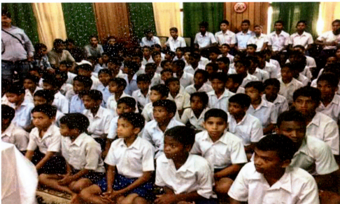
Figure 6: The inmates of the Vanavasi Kalyan Ashram

The Office bearers of the Ashram apprised to the Hon'ble Vice Chairperson of the Commission that they are running the projects out of their own resources and requested the Commission for recommending their case to the Ministry of Tribal Affairs for sanction of grant-in-aid.