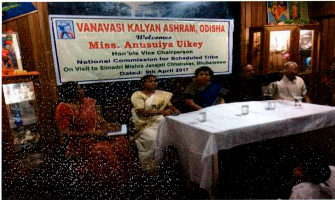
Figure 5: Meeting of the Hon'ble Vice Chairperson and Director of the Commission with the inmates of the Vanavasi Kalyan Ashram

also advised that students of the Ashram who are poor in their study may be provided extra tutorial classes of English Science and Mathematics.