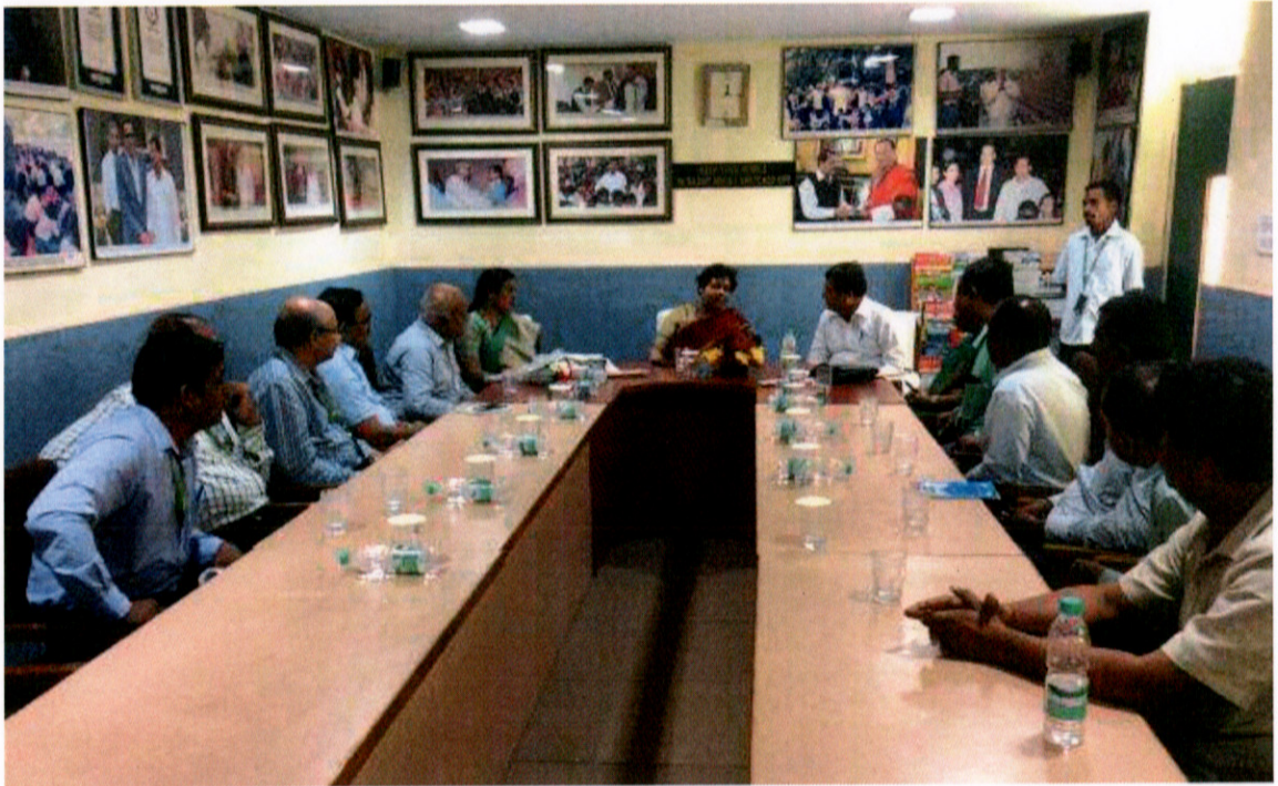
Figure 8: Hon'ble Vice Chairperson during a meeting with officials at KISS