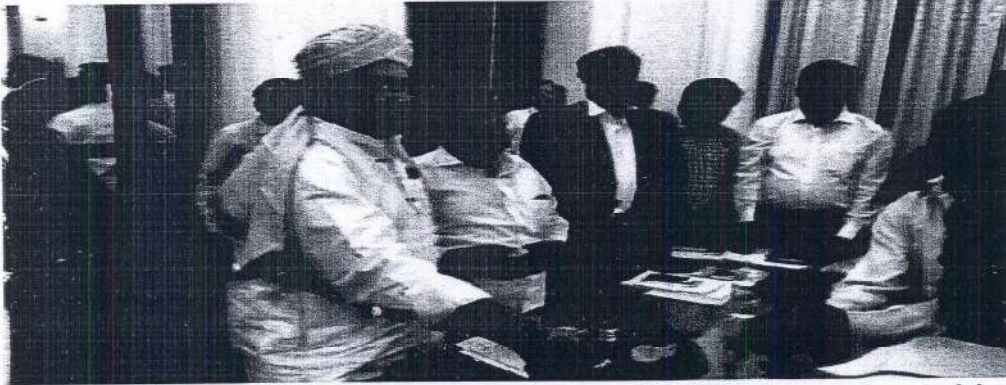
Dr.Rameshwar Oraon, Hon'ble Chairperson, NCST being welcomed by Deputy Commissioner, Mysuru