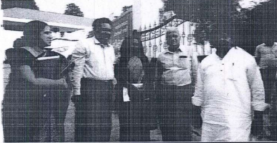
Dr. Rameshwar Oraon, Hon'ble Chairperson, NCST with District Officers in Chamraj Nagar District

20.1) The Commission held meeting with Deputy Commissioner, Chamraj Nagar and other District level officers and discussed the issue which emerged during field visits and implementation of developmental programs in the District. Gist of points /advise is as under: