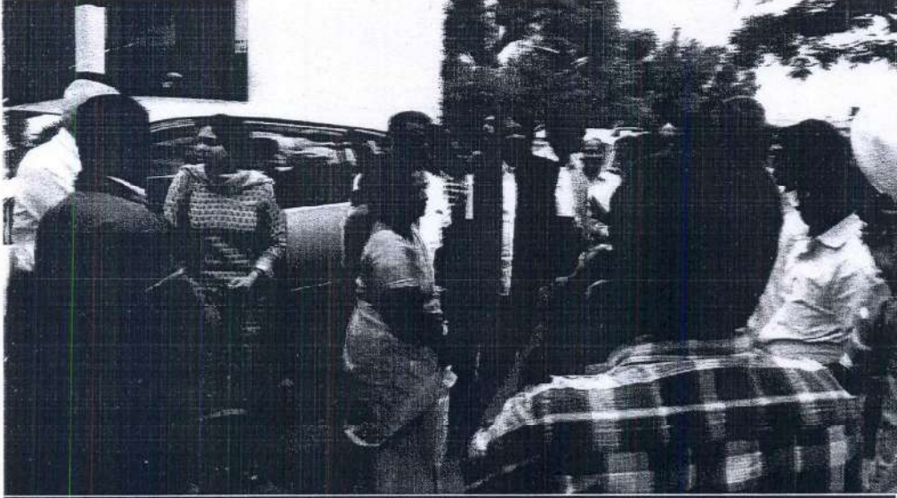
Dr. Rameshwar Oraon, Hon'ble Chairperson, NCST in PHC, Basvanahalli