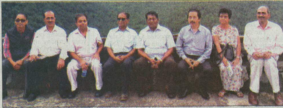
NCST chairperson (4th from L) with NCST team and state officials pose for lens at Khonoma village on Wednesday.